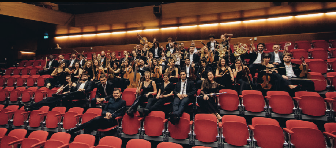
UNITED SOLOISTS ORCHESTRA