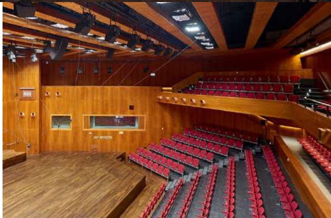
AUDITORIO RSI LUGANO 26.04.2019