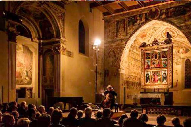
COLLEGIO PAPIO ASCONA 27.04.2019