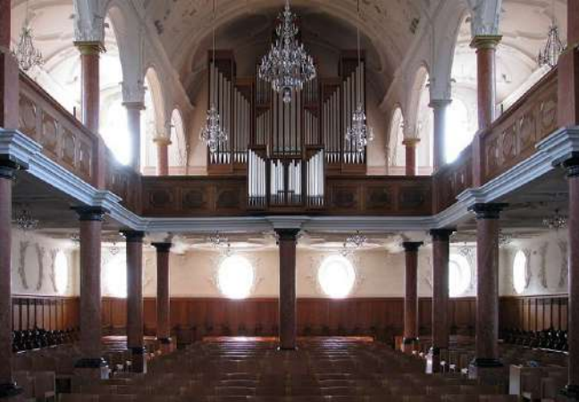
ST. PETER KIRCHE ZURICH 25.04.2019